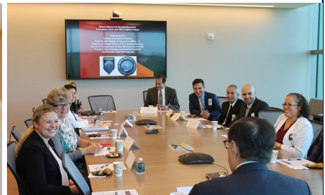
At the meeting