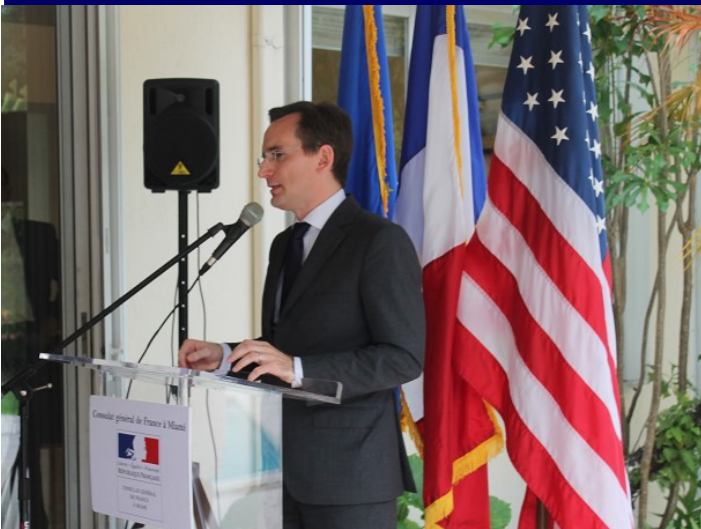
Hon. Clément Leclerc, Consul General of France