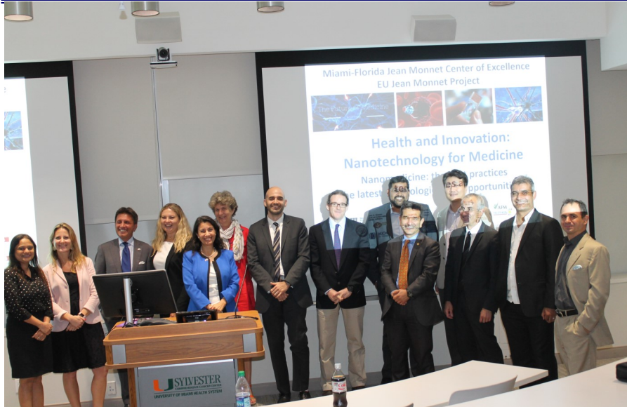
At the UM Silvester Comprehensive Cancer Center, American and European experts in Nanotechnology for Medicine met and shared their best practices and latest technologies and opportunities in Nanomedicine.—June 14, 2017