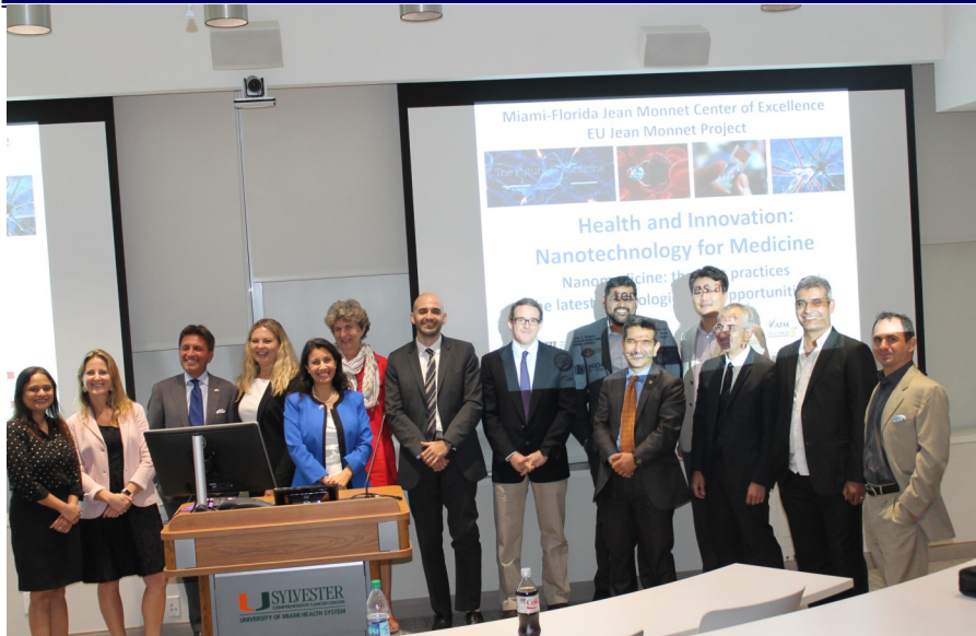
At the UM Silvester Comprehensive Cancer Center, American and European experts in Nanotechnology for Medicine met and shared their best practices and latest technologies and opportunities in Nanomedicine.—June 14, 2017