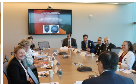
At the meeting