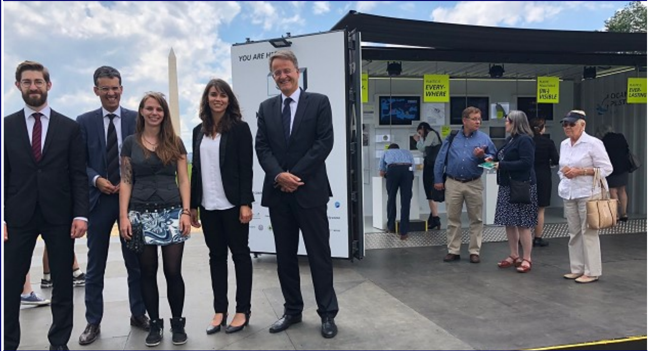
German Delegation from KDM German Research Consortium, Embassy of the Federal Republic of Germany, and the Federal Ministry of Education and Research